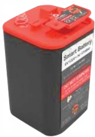
Smart Battery makes existing taper lamps smart

Each device is connected via secure, cloud-based systems to our device management platform, which tells the equipment how to behave and automatically logs every event to help improve data capture and analysis. Real-time site information and the equipment status can be viewed at any time via the online customer information portal.