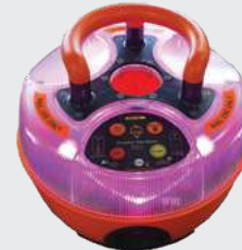
Purple Alarm mode

For more information visit www.highwayresource.com or call us on +44 (0) 800 206 13 19