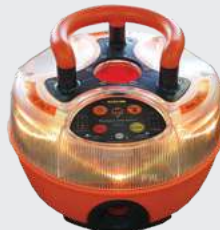
Yellow Access granted mode (alarm temporarily de-activated)