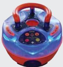
Blue Access request mode

Standard Dorman static lamps are converted into Smart Lamps by integrating HRS' proprietary motion sensor technology, which enables the lamps to detect motion. Deployed on traffic cones, the lamps have been programmed to detect movement but also designed to filter out and identify minor motion caused by weather conditions, such as a wind.