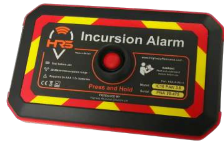
Wireless Incursion Button for gatemen

Intellicone makes it possible to electronically alarm full closure points which detect any unauthorized entry remotely. It consists of Intellicone Smart cone lamps which can detect motion and Portable Site Alarm technology. This brings an added deterrent effect to people attempting unauthorized access at full closure points. It has proven on many occasions to significantly reduce incursions by opportunistic road users both on the Strategic Road Network and in rural settings and allows closure points to be monitored remotely.