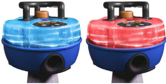
Portable Site Alarm provides an audiovisual warning to workers

Intellicone is easy to deploy and provides Traffic Management Operatives with the ability to instantly warn the workforce in case a vehicle forces its way onto site. This is done by pressing the incursion button which raises a local alarm and activates Portable Site Alarms positioned in the work areas or on works vehicles with no limitation in distance.