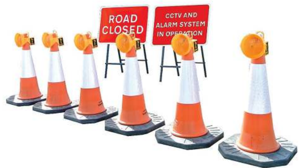
Smart Lamps Detect movement to raise an alarm

The operative can raise a red alarm to signify an errant vehicle incursion and a potential threat to life, or a lower level blue alarm which is a warning that an emergency vehicle, gritter or escorted vehicle is on site. This helps improve site communication, safety and efficiency.